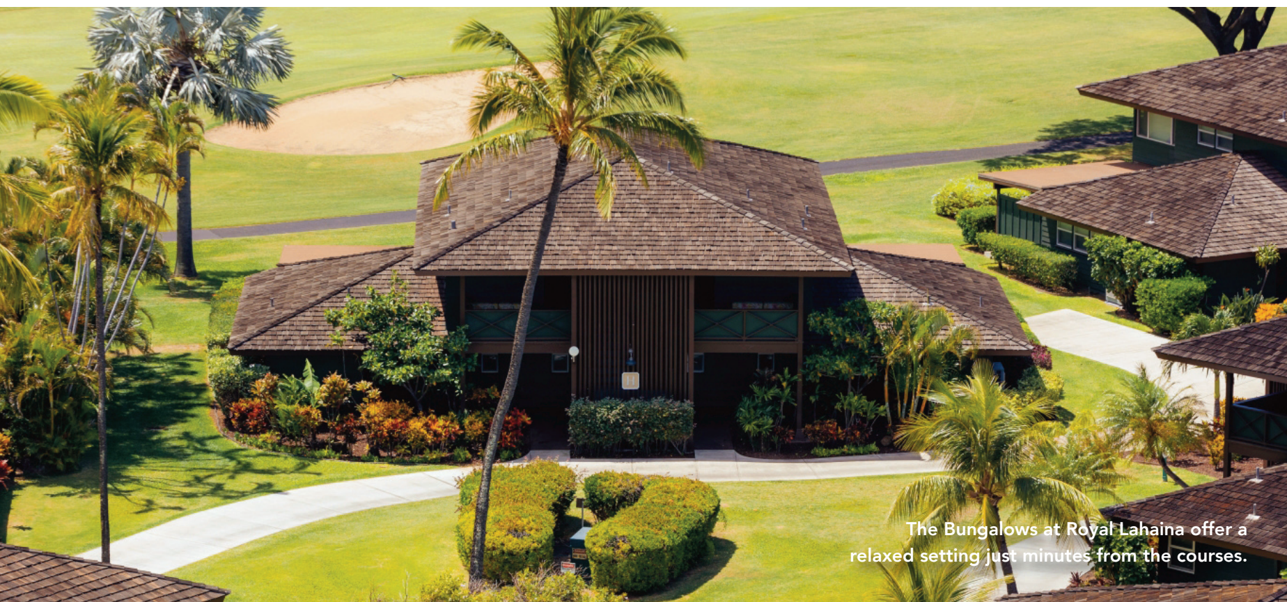
The Bungalows at Royal Lahaina offer a relaxed setting just minutes from the courses.

CLICK HERE for additional information, reservations, and more.