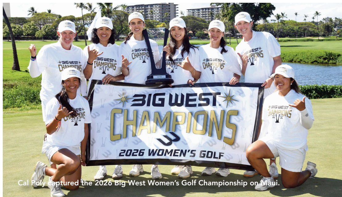
Cal Poly captured the 2026 Big West Women's Golf Championship on Maui.