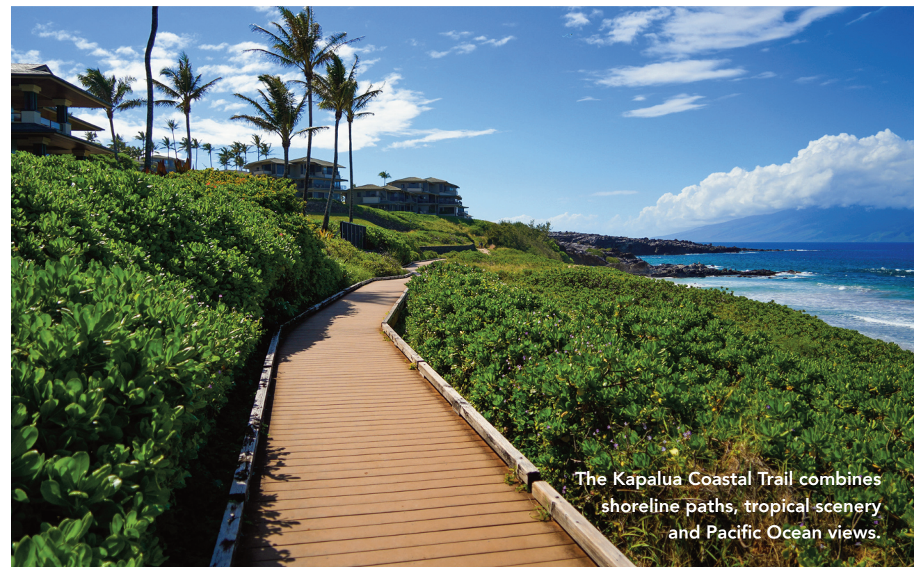
The Kapalua Coastal Trail combines shoreline paths, tropical scenery and Pacific Ocean views.

One of the appealing aspects of the Kapalua Coastal Trail is its accessibility.