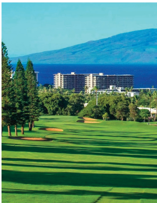
The Good Good Girls match was decided on the Royal Course's scenic 10th hole.

YouTube's Good Good Girls brought energy, competition and island spirit to Kā'anapali Golf Courses