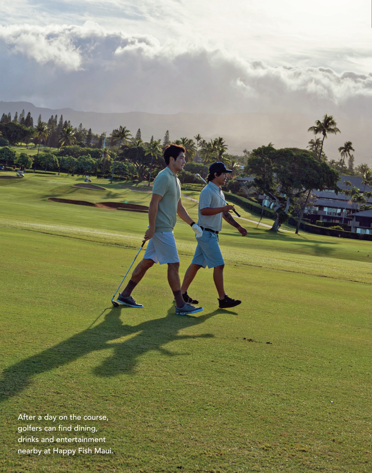
After a day on the course, golfers can find dining, drinks and entertainment nearby at Happy Fish Maui.