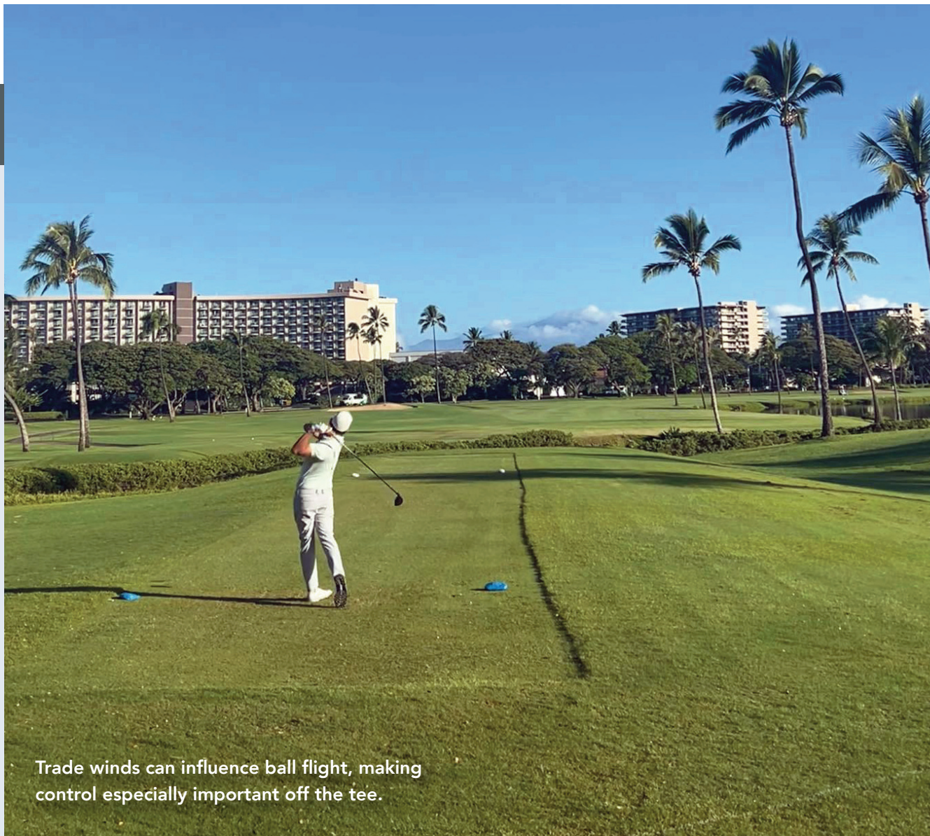
Trade winds can influence ball flight, making control especially important off the tee.

CLICK HERE for inquiries and to learn more about golf lessons.