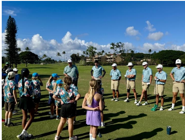
On Sunday, the Hawai'i Rainbow Warrior men's golf team held a clinic at Kā'anapali for keiki in the Maui Junior Golf Association and Lahaina Junior Golf Association.

Following Sunday's round, the Hawai'i Rainbow Warrior golf team held a clinic for keiki in the Maui Junior Golf Association and Lahaina Junior Golf Association. Attendees received swing lessons, learned about college recruiting and were able to talk with Hawai'i's student-athletes.